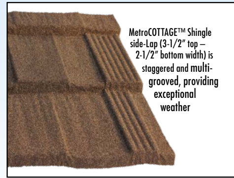
MetroCOTTAGE™ Shingle side-Lap (3-1/2" top – 2-1/2" bottom width) is staggered and multi-grooved, providing exceptional weather