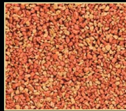
Mission Gold-43-CC* (Light Accent) (COOL Color*)