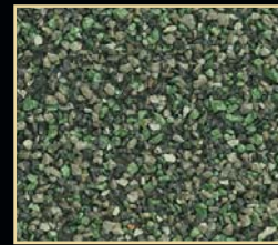
Sage Green-50 (Dark Accent)