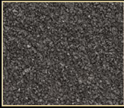
Charcoal-36 (Solid Color)

With a Metro roof overhead your home will be ready to withstand nature's toughest challenges.