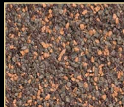
Driftwood-37-CC** (Light Accent) (Energy Star®)**