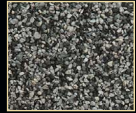
Birch-II-31 (Dark Accent)