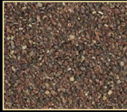
Shadow Wood-51 (Dark Accent)