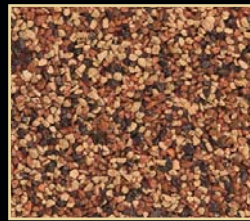
Beechwood-25 (Dark Accent)