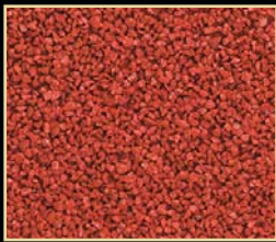
Mission Red-45 (Solid Color) Barcelona-23 (Dark accent)