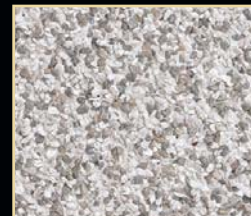
Aspen-71-ES** (Dark Accent) (Energy Star®)**