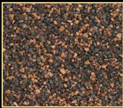
Walnut-60 (Dark Accent)