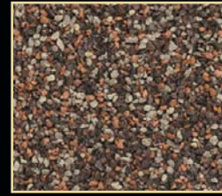
Weathered Timber-65 (Dark Accent) Western Wood-66 (Light Accent)