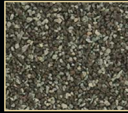
Weather Slate-68 (Dark Accent)