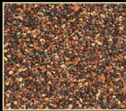
Cedar-34 (Light Accent)