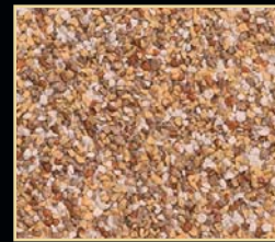
Oak-47-CC* (Dark Accent) (COOL Color*)