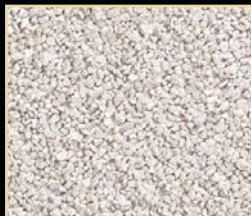
Pearl White-70-ES** (Solid Color) (Energy Star®)**