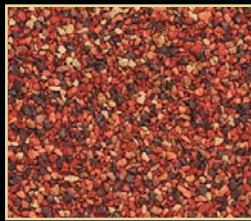
Terra Cotta-55 (Light Accent)