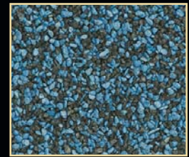
Blue-32 (Dark Accent)