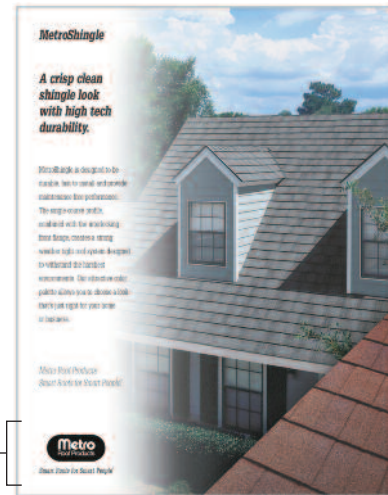
TYPICAL USE OF THE LOGO IN A PROMOTIONAL PIECE.

The logo should not be used any closer than 3/8" to any trimmed edge.