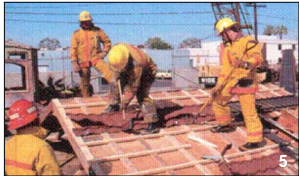
While being lightweight, the shape stamped into the metal makes the panels strong. They can easily be cut with an axe or carbide-tipped chain or circular saw. Though an axe is more than adequate, carbide-tipped chain saws cut through the metal very fast and can remove the sheathing at the same time.