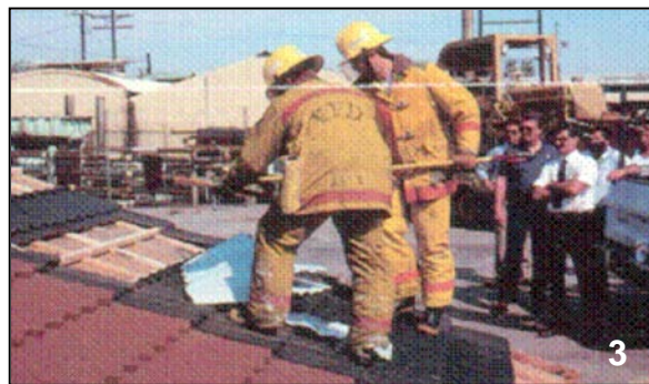
A pick-headed axe can easily lift the front of the panels away from the fasteners. Rubbish hooks are used to peel the panels away from the roof.