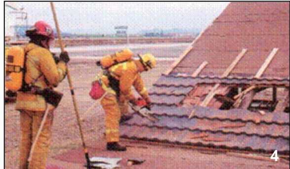
The metal roof may have been installed over old, existing roof materials, such as wood shakes or shingles, asphalt shingles, etc. The weight of the metal roof system would be less than 1.5 pounds per sq ft.