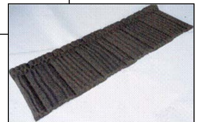
Shake-style stone-coated panel (approx. 15" x 52")