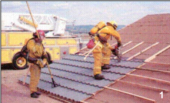
Firefighters investigate the roof assembly by cutting a small triangular inspection hole to reveal the substructure of the metal panel roof system. This photo shows a 1 x 4 and 2 x 2 wood batten erid system nailed to the roof's framing.

The six (6) pictures in this section show various methods for gaining access to and ventilating modular panel metal roofs. The techniques shown provide a general guide for fire service professionals.