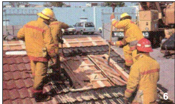
A "Louver" cut (shown here) opens a roof for ventilation without having to remove the roofing.