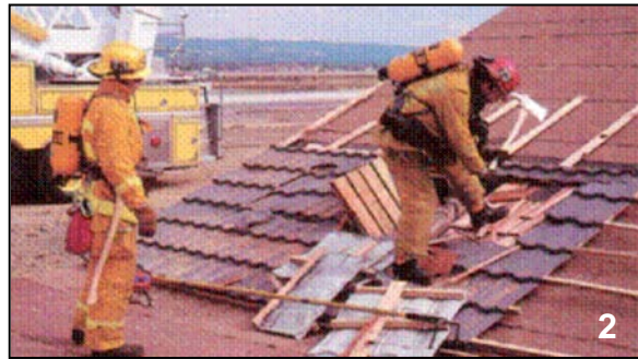
A "head" cut across and high on the roof makes it possible to peel back the metal roof panels (beginning at the top and working towards the bottom) with a rubbish hook.