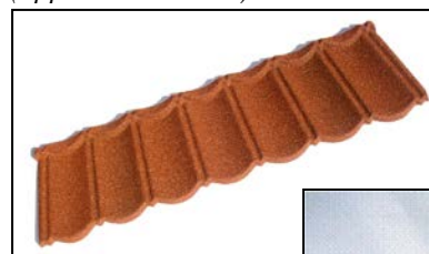
Tile-style stone-coated panel (approx. 15" x 52")

One way to identify a modular panel metal roof is to examine the fascia or rake/gable sections of a structure. Many modular metal roof panels incorporate wide-faced painted or stone-coated metal flashing pieces installed around the perimeter of the roof (see photos).